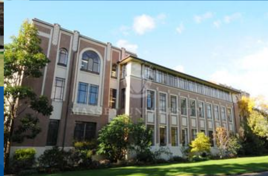
Sir Geoffrey Peren Building